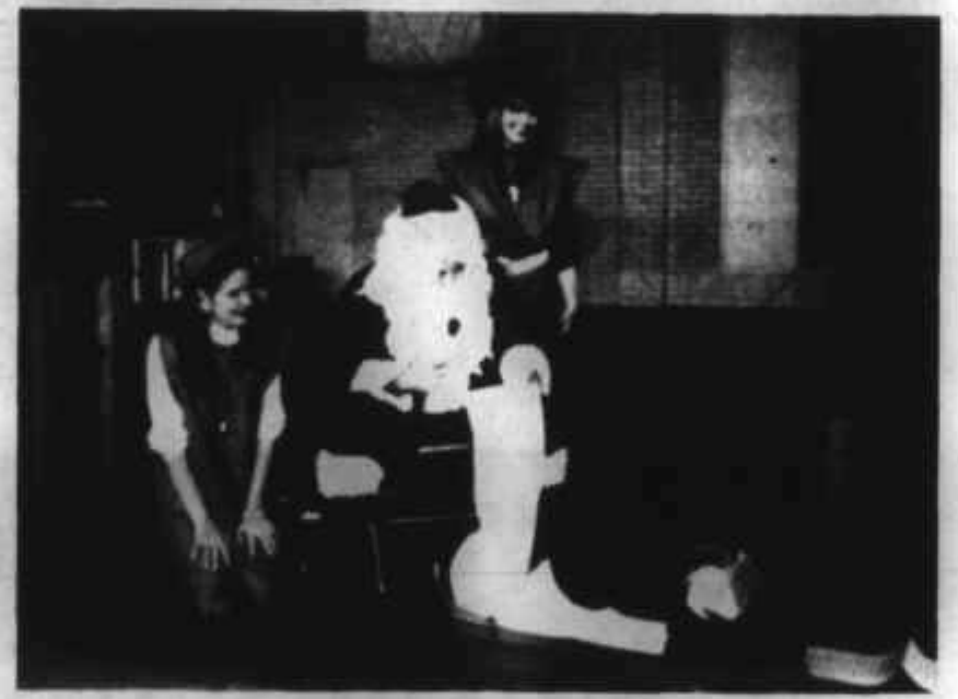
Santa visits ELPS